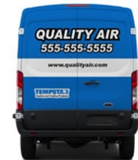
KUV / Utility Truck TV19-01UT

*Requires vehicle measurements for custom fit