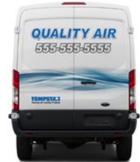
KUV / Utility Tr TV19-02UT

*Requires vehicle measurements for custom fit