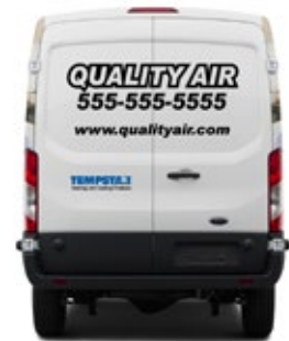
KUV / Utility Tr TV19-04UT

*Requires vehicle measurements for custom fit