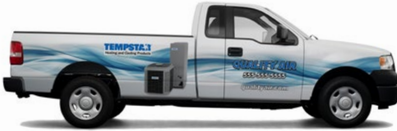
Pickup Truck TV19-02PU