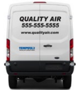
KUV / Utility Tr TV19-06UT

*Requires vehicle measurements for custom fit