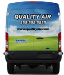
KUV / Utility Tr TV19-05UT

*Requires vehicle measurements for custom fit