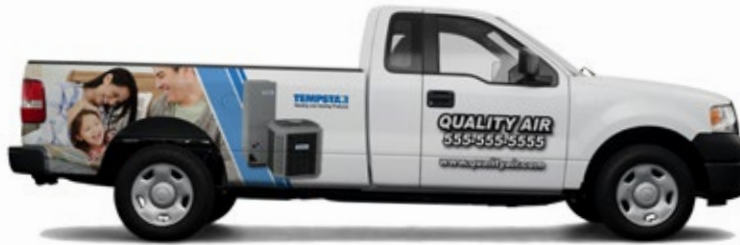
Pickup Truck TV19-04PU