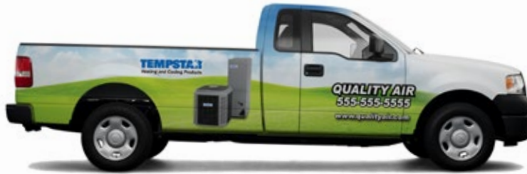
Pickup Truck TV19-05PU