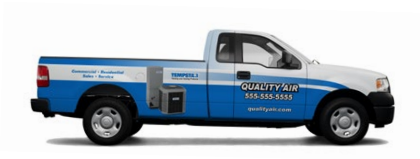
Pickup Truck TV19-01PU