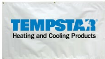
Outdoor/Indoor Banner 3' x 5' - TV015B