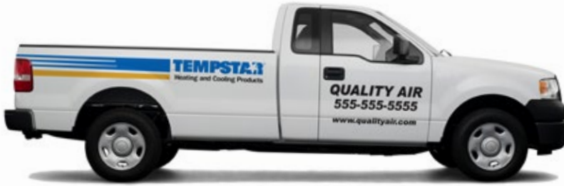
Pickup Truck TV19-06PU